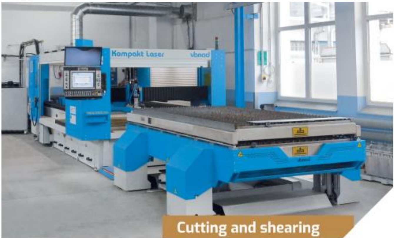
Cutting and shearing